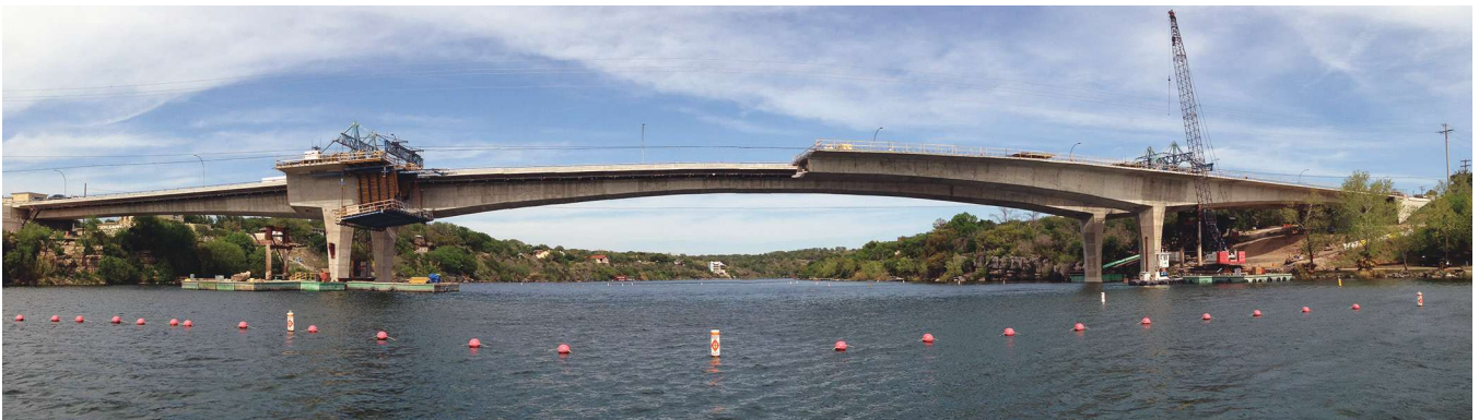
Full cantilever at pier 2 of the Marble Falls Bridge. Segment construction is beginning at pier 3.

For more information on this bridge, see the article in the Spring 2013 issue of ASPIRE.™