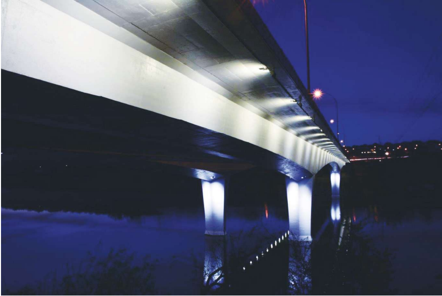
Completed twin segmental box-girder bridges at Marble Falls, Tex. Photo: Archer Western Contractors.

by Aaron Garza, Texas Department of Transportation