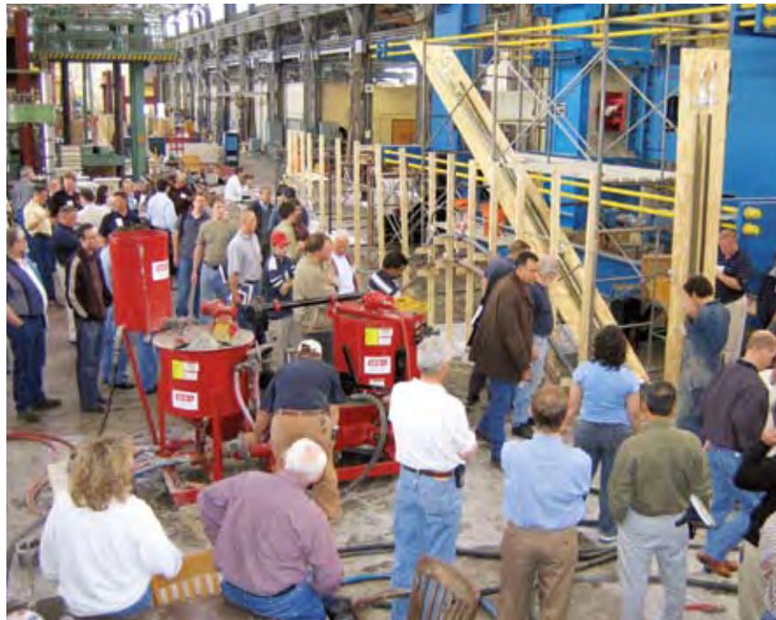
Figure 10 - Large Specimen Grouting Demonstration.

On May 14 & 15, the American Segmental Bridge Institute will sponsor a two-day seminar on design and construction practices of segmental concrete and cable-stay bridges to assist owners, contractors, engineers, consultants and suppliers on all aspects of segmental and cable-stay bridge design and construction. The seminar program and registration information will be posted to the ASBI website in February.