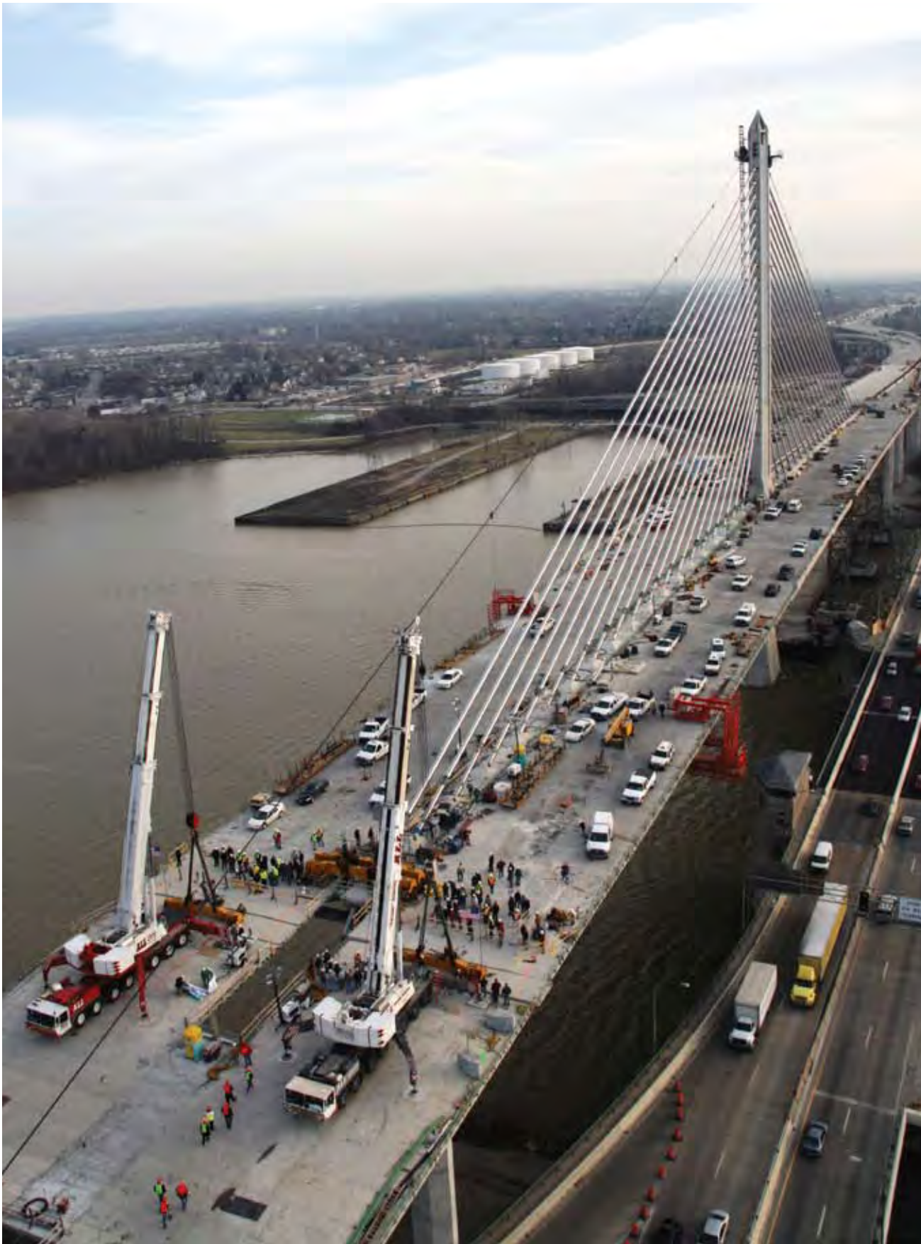
Figure 13 - Placement of final pair of segments Veteran's Glass City Skyway, Toledo, OH on Dec. 20, 2006.