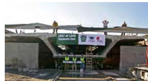
Figure 25 - Last segment for the Susquehanna River Bridge.