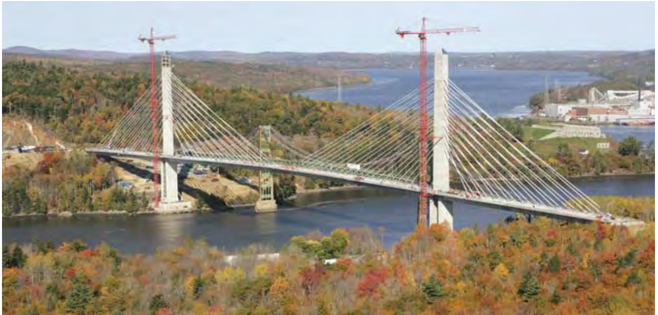
Figure 18 - Penobscot Narrows Bridge.

with carbon fiber composite strands to evaluate this material under actual conditions. The cradle system provides the opportunity for selective removal, inspection and replacement of strands, while the bridge is under traffic. The observatory will open to the public in the spring, followed by the first annual Bridgefest in June of 2007.