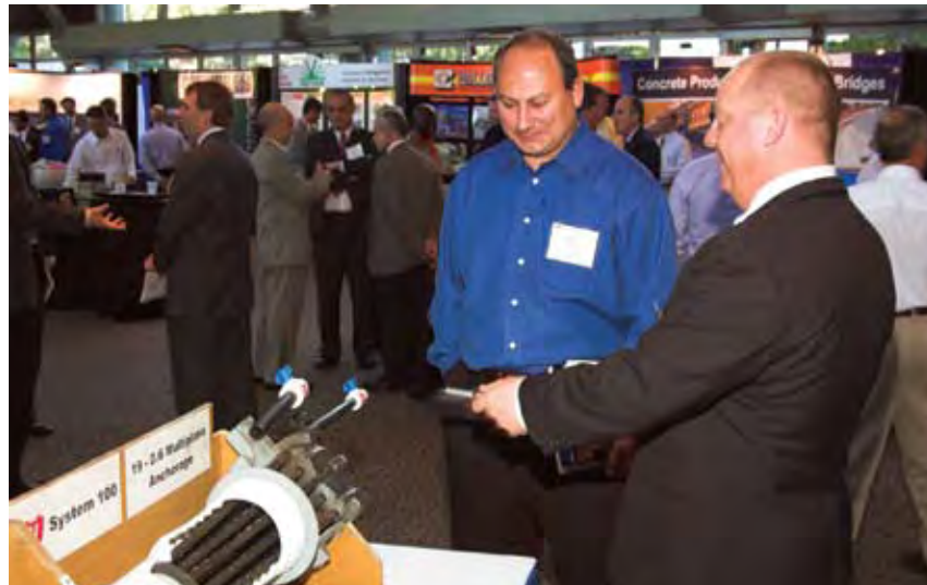
Figure 6 - ASBI Exhibit activity.