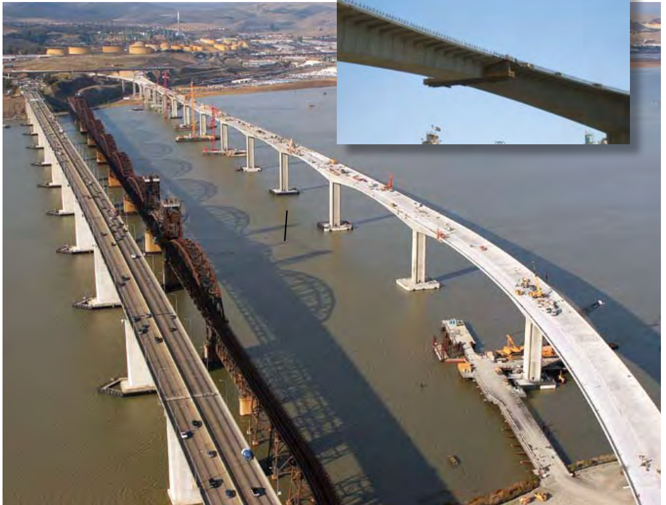
Figure 23 - (inset) Benicia-Martinez Bridge Closure Segment Construction.