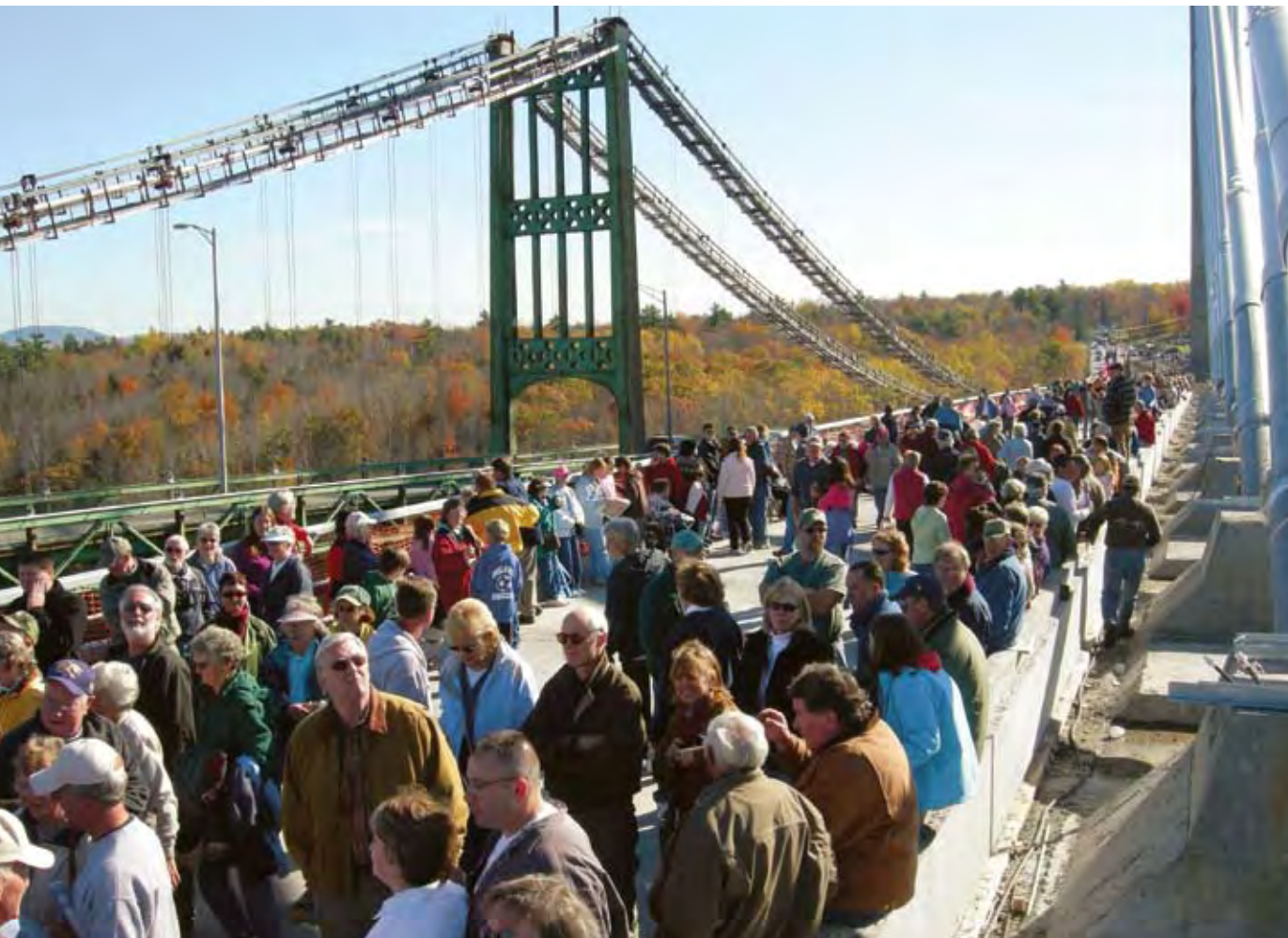
Figure 17 - Penobscot Narrows Bridge & Observatory, linking Waldo and Hancock Counties, Maine.

the new bridge just 40 months after the emergency replacement began in the summer of 2003. The 2,120' cast-in-place concrete bridge has a 1,171' cable stayed main span and features state-of-the-art technology to provide the strands with a protective environment ( Fig. 18 ). FIGG's patented cradle system was used to carry the stays through the pylon in an alternating V pattern, originating at the center of the bridge. This opened the core of the pylon for use as an elevator shaft to carry sightseers to the top of the 420' pylon and the multi-level glass observatory. Finish work will be completed by the Cianbro/Reed + Reed IV on both the bridge and the observatory by spring, including the substitution of three traditional steel seven wire cable stay strands