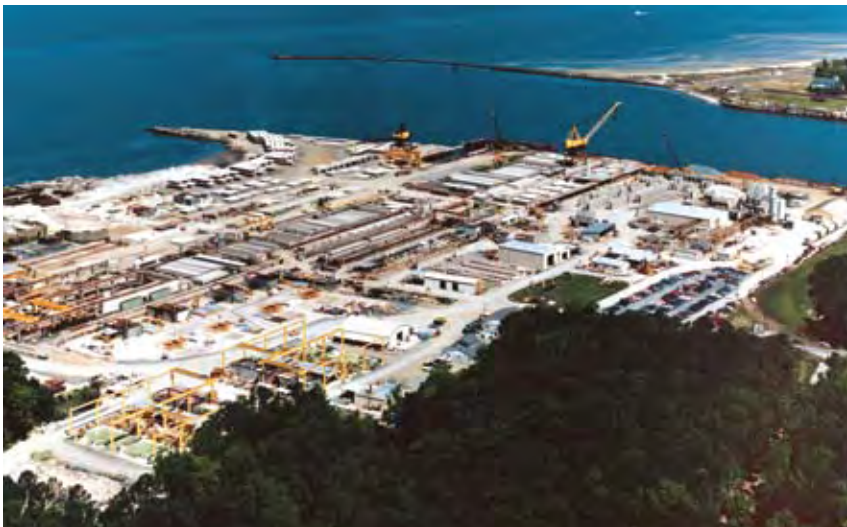
Figure 11 - Bayshore Concrete Products Cape Charles Facility.

In 1989 Bayshore Concrete opened a second plant in Chesapeake, Virginia to produce a variety of square piles and smaller structural members to better service the Tidewater/Hampton Roads area of Virginia. The Chesapeake facility employs approximately 85 people.