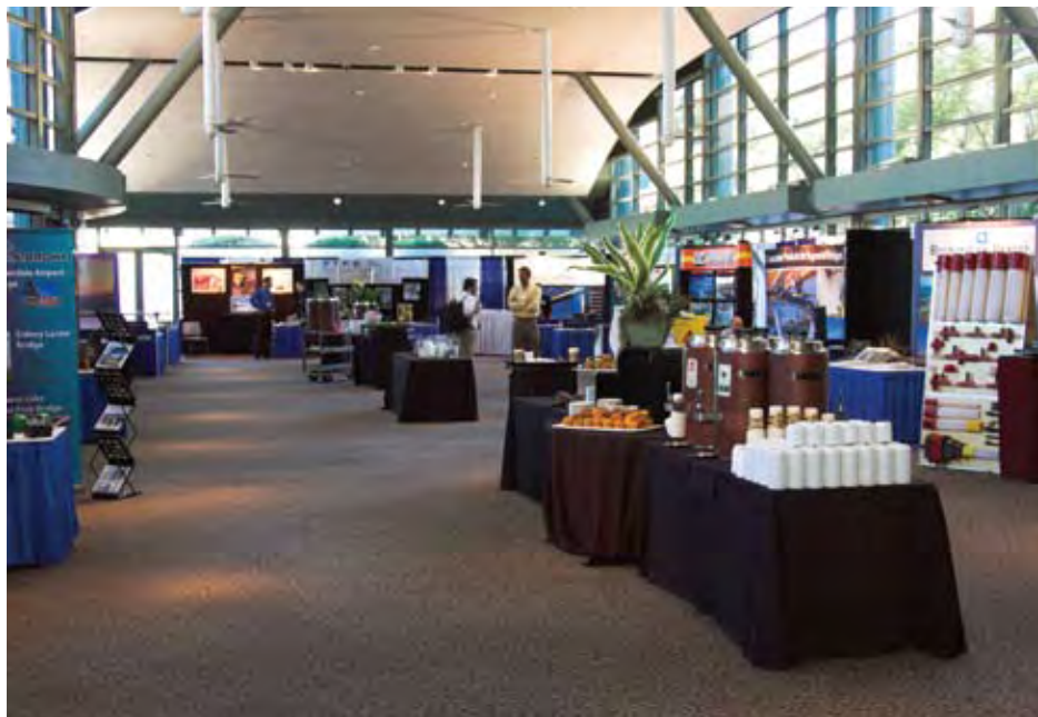
Figure 2 - Exhibitor Showcase, ASBI Convention.

BASF Building Systems Bilfinger Berger Civil, Inc. The D.S. Brown Company DEAL/Rizzani de Eccher USA Diebolt & Company DSI ENERPAC F&M Mafco, Inc. Freysinet, LLC Fyfe Company, LLC General Technologies, Inc. Hilman Rollers Howell Interqup Strukturas LARSA, Inc. MEXPRESA R.J. Watson, Inc. Sika Corporation Sumiden Wire Products Corporation Vector Corrosion Technologies VSL Watson Bowman Acme - A BASF Company Williams Form Engineering