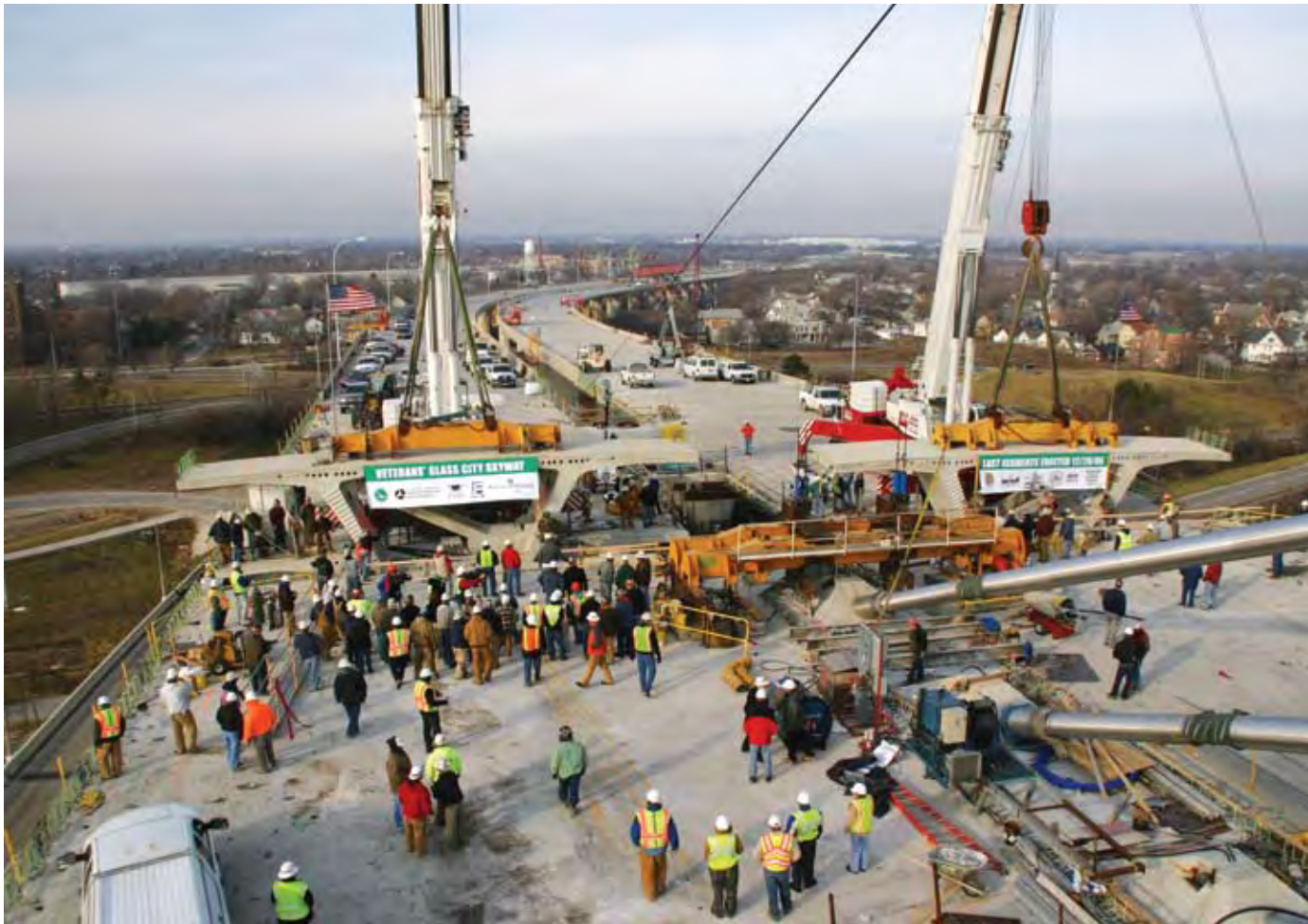
Figure 12 - Placement of final pair of segments Veterans' Glass City Skyway, Toledo, OH on December 20, 2006.

The final main span closure pour is expected to be completed by the end of January 2007. Barrier rails, roadway lighting, expansion joints and the installation of the LED light fixtures and glass panels in the pylon will be completed this spring. Grand opening celebrations are scheduled for the end of May, 2007.