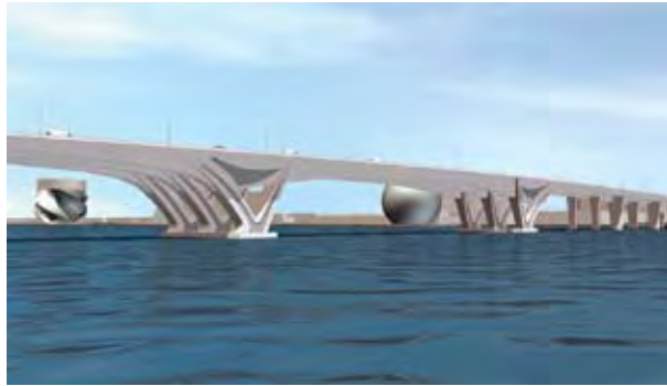
Figure 26 - Rendering of the Saadiyat Bridge.