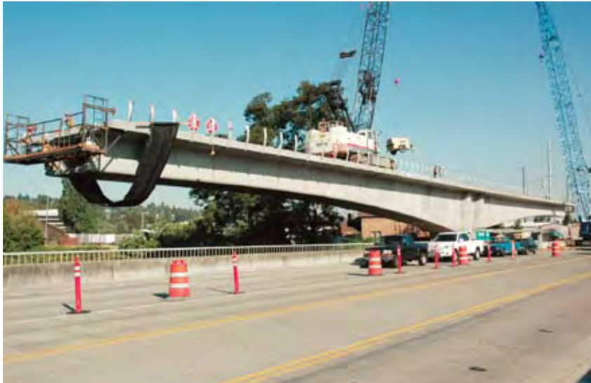
Figure 28 - Duwamish River Crossing - 350' Main Span.