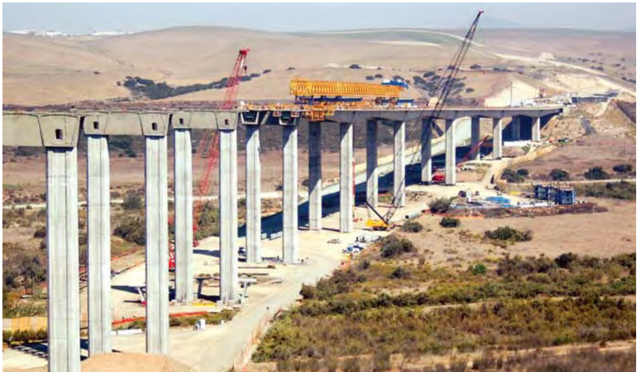
Figure 16 - Otay River Bridge (photo courtesy of International Bridge Technologies, Inc.).

All cast-in-place concrete substructure elements are now complete, and only two of the eleven piers remain for superstructure erection. Precasting operations are