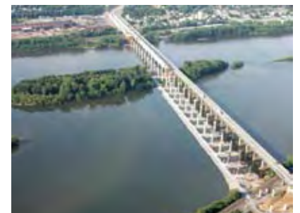
Figure 24 - Susquehanna River Bridge (I-76), December 29, 2006 (photo courtesy of FIGG).

Pennsylvania's first precast concrete segmental vehicular bridge is nearing completion (Fig. 24). The Susquehanna River Bridge, owned by the Pennsylvania Turnpike Commission, features twin 5,910 linear foot structures to carry I-76 over the Susquehanna River. Erection of the westbound structure was completed on November 7, 2006 and casting of the 1,040 precast segments was completed on December 29, 2006 (Fig. 25). Erection operations of the eastbound structure are on schedule for completion in late February, 2007. The bridge is scheduled to open to traffic by May 4, 2007 and plans are being made for a community bridge walk prior to the traffic opening.